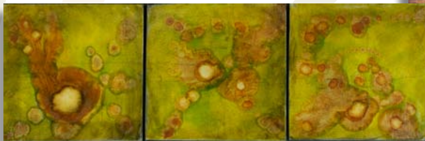
"Nucleus" 24 x 12" 2009 oil on gold