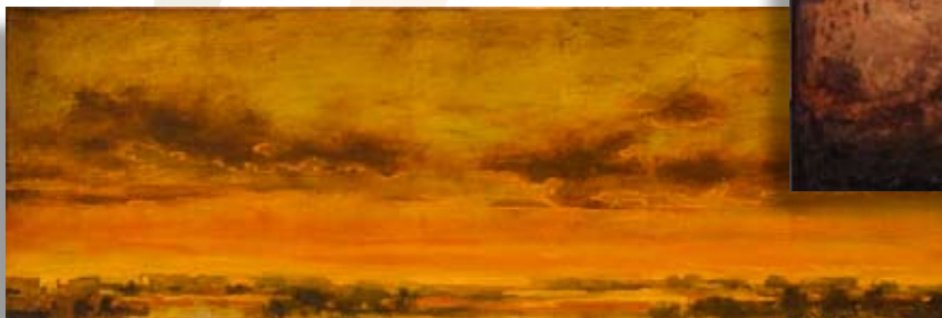
"Long Evening" 12 x 24" 2009 oil on gold

Big Sky Studio Gallery • 414 E. Hyman Avenue, Aspen, CO 81611 • (970) 925.1343 • (970) 948. 4075 open daily 12:00 - 8:00 pm, or by appointment