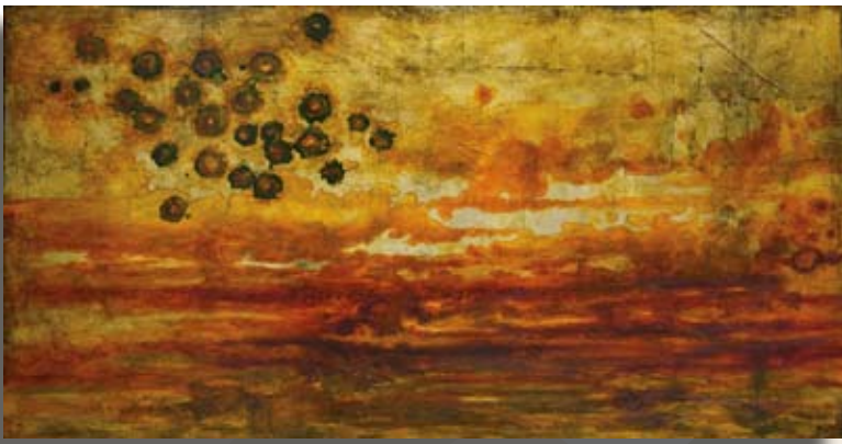
"Stars and Stripes" 24 x 46" 2009 oil on gold