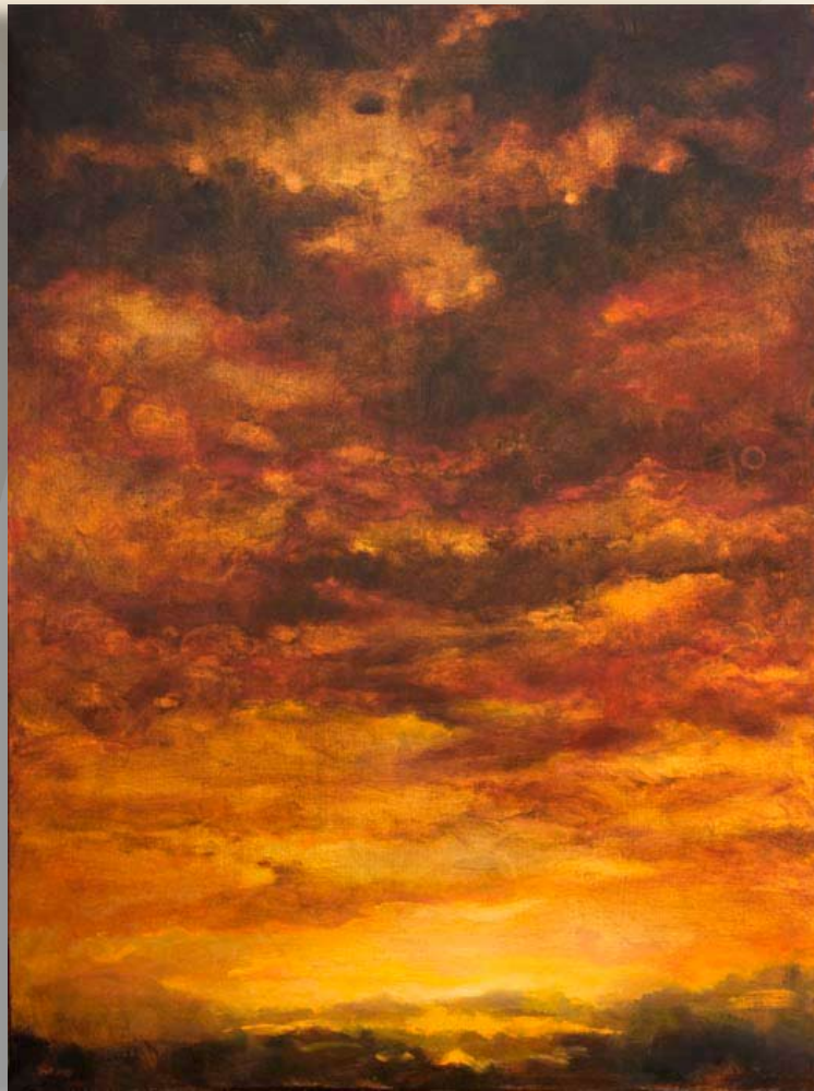
"Sorcerer" 48 x 36" 2009 oil on gold