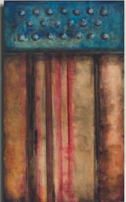
"New Flag" 60 x 36" 2009 oil on gold