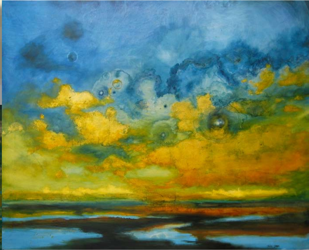
"You, Me and the Sea" 48 x 60" 2008 oil on gold

In our first 107 days, we placed works with collectors in London, Australia, New York, Chicago, Texas and other locales across the United States.