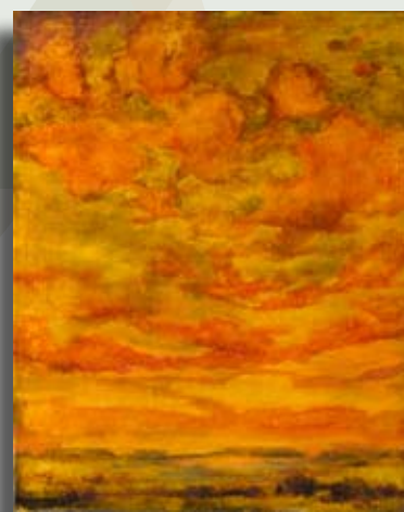
"Tanager Drops" 20 x 16" 2008