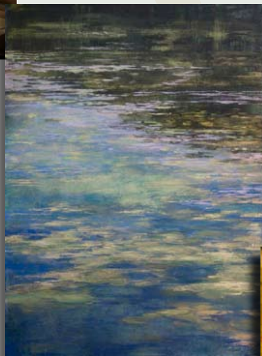
"Still Water" 48 x 36" 2008 oil