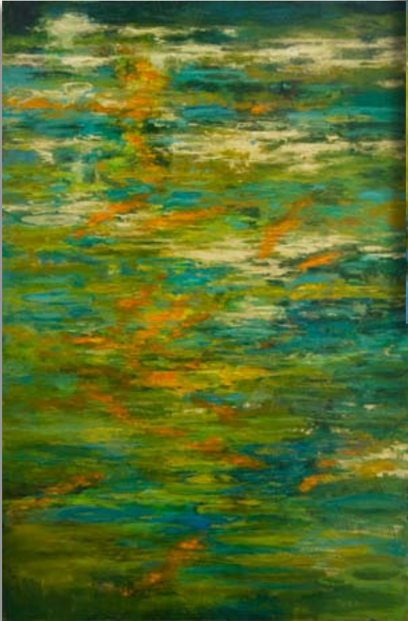
"Swimming Koi" 36 x 24" 2009 oil on gold

All of Tania's available work can be better viewed at the website www.taniadibbs.com