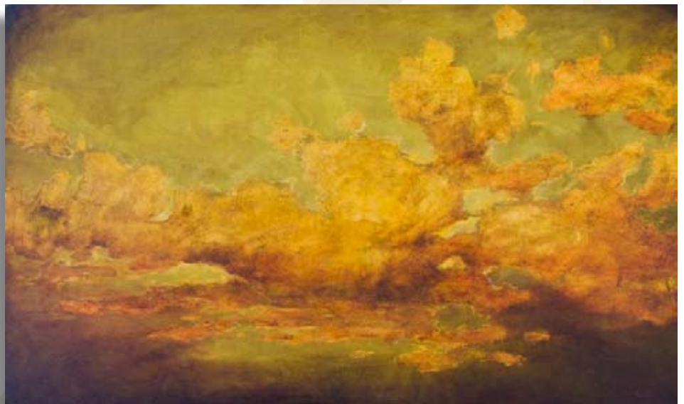
"Sky Over Steel" 36 x 60" 2009 oil