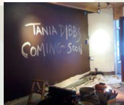
Getting the space ready for occupancy