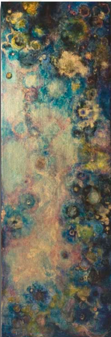
"Evolution" 12 x 24" 2009 oil on gold