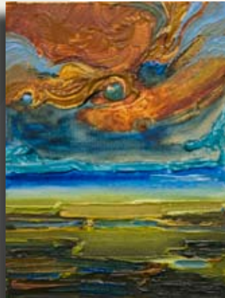
"Putty Sky" 8 x 10" 2008 oil