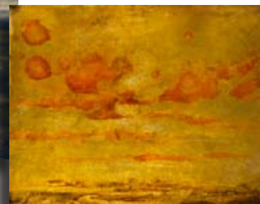
"Zen" 16 x 20" 2009 oil on gold leaf

Big Sky Studio Gallery • 414 E. Hyman Avenue, Aspen, CO 81611 • (970) 925.1343 • (970) 948. 4075 open daily 12:00 - 8:00 pm, or by appointment