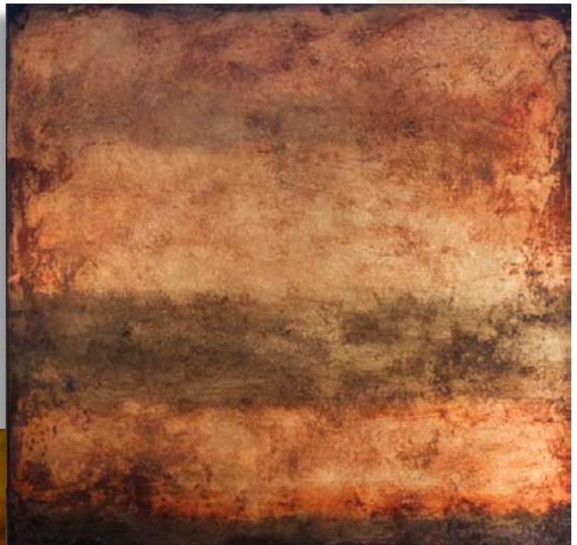
"Sunset" 24 x 24" 2009 oil on gold

All of Tania's available work can be better viewed at the website www.taniadibbs.com